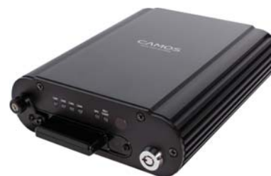
2.5" SSD Type