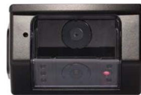
Twin View Camera